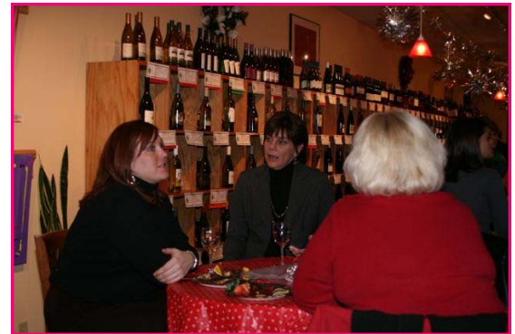
Networking Event: AWC, Springfield members spend a relaxing evening sampling wines & appetizers while mingling with fellow members.